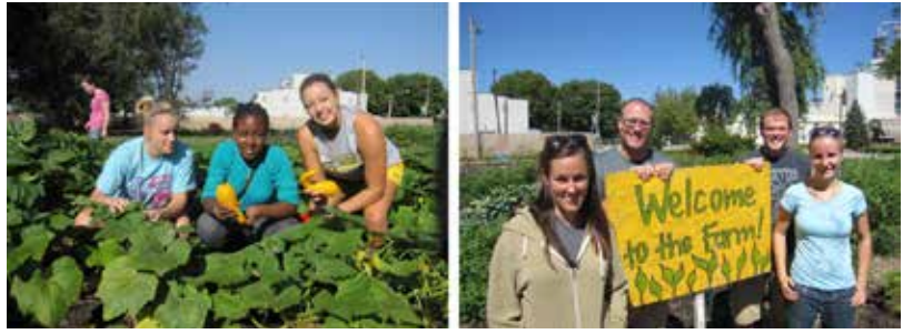
Figure 5: Volunteers at the Ellis Boulevard Urban Farm.