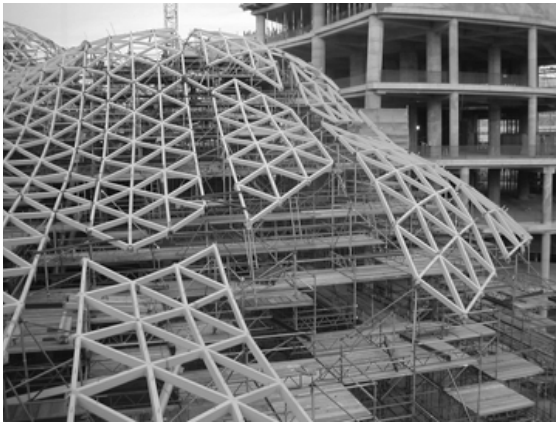
Fig. 4. Steel ladders installed on site

here that adjustments were made to accommodate installation tolerances. The loose members were cut down if too long or plates were added at weld points if too short. Each site weld then had to be inspected and tested according to a series of protocols. This system allowed the final built geometry to reflect the designed geometry as closely as possible in that it distributed dimensional discrepancies across the entire net. Had the ladders been welded to each other or the entire net assembled with individual pieces on site, the tolerances would have accumulated from one side to the other, affecting interfaces with surrounding construction.