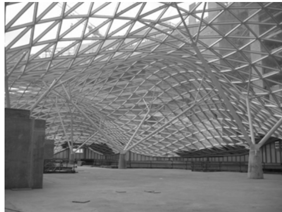
Fig. 5. Interior view of the completed roof

The use of three-dimensional computer modeling has allowed architects to expand the complexities of building form and spatiality not only by making the design of complex forms and conditions more accessible but, perhaps more importantly, by making their construction and thus their use and inhabitation a reality. If an architect feels, however, that he or she can now turn over attention to construction details and processes exclusively to the fabricators and contractors, he or she will be sorely disappointed. If anything, the understanding of the construction methodologies and level of craft required by digitally determined projects are even more critical to the work of the architect. Until we find a way to erect buildings with robots in completely controlled environments, the ingenuity of human craft and experience will remain a fundamental part of the building process. Were we to give this up, we would lose the fundamental humanness of design and construction.