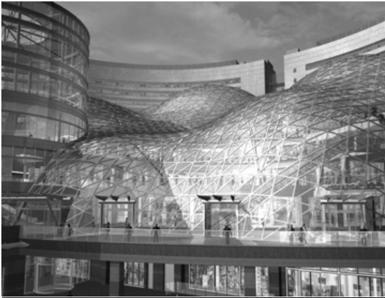
Fig. 1. Rendering of the Zlote Tarasy atrium roof at the main entrance

continuous, without movement joints. As a result of discussions during design development, it was determined that the roof would be a net of steel members that acted as a single structural element, allowing movement only where the steel net met the concrete structure of the surrounding buildings. In order to calculate the forces in the various members, the lines of the design model had to be translated into dimensional steel. Were the lines in 3D Studio the joints between glass panels? Or the centerlines of the steel members? Or the centerlines of the bottom or top surfaces of the steel members? Ultimately, as the design of the glazing system had not yet been considered and therefore could not be given dimension and as the structural engineers were primarily concerned with the steel components, they decided that the lines in the model would represent the centerlines of the steel members.