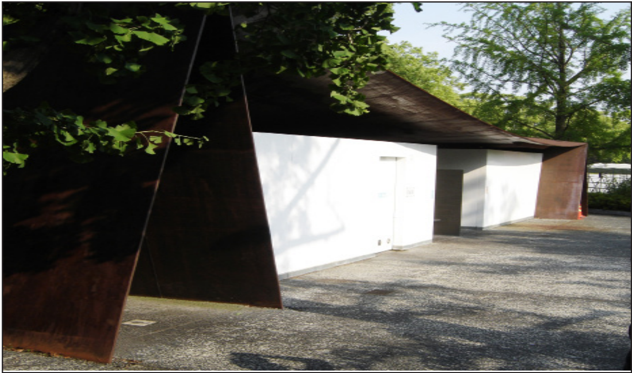
Fig. 5 Public Toilets

and Kiyoshi Seike were rediscovering the Japanese vernacular during this period and the work of the craftsman was once again in demand.