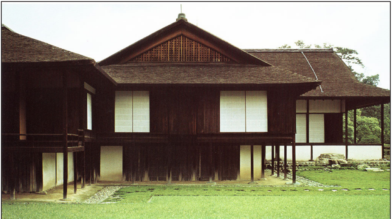
Fig.1 Katsura Detached Villa