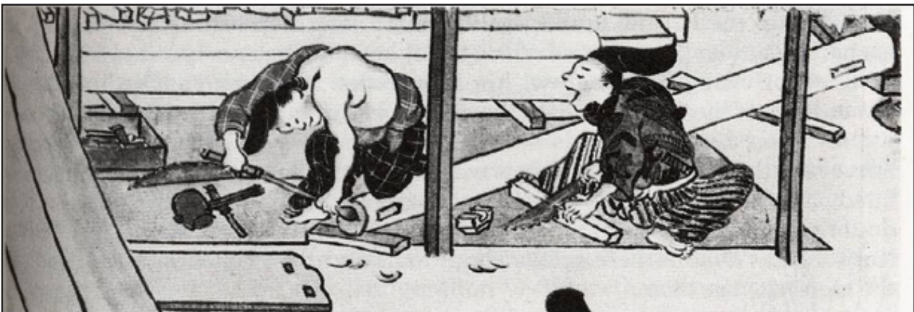
Fig.3 Carpenter's Apprentice

In all of the trades, craftsmen were subjected to a rigorous apprenticeship. Because they used tools from a very young age carpenters developed a high degree of manual dexterity and through years of immersion in the building process they developed an intuitive sense not only for their tools but also for materials, structure and proportion. It could be argued that more than any professional today Japanese carpenters were holistic building experts in the technology of the day. William Coaldrake writes in The Way of the Carpenter , "The carpen-